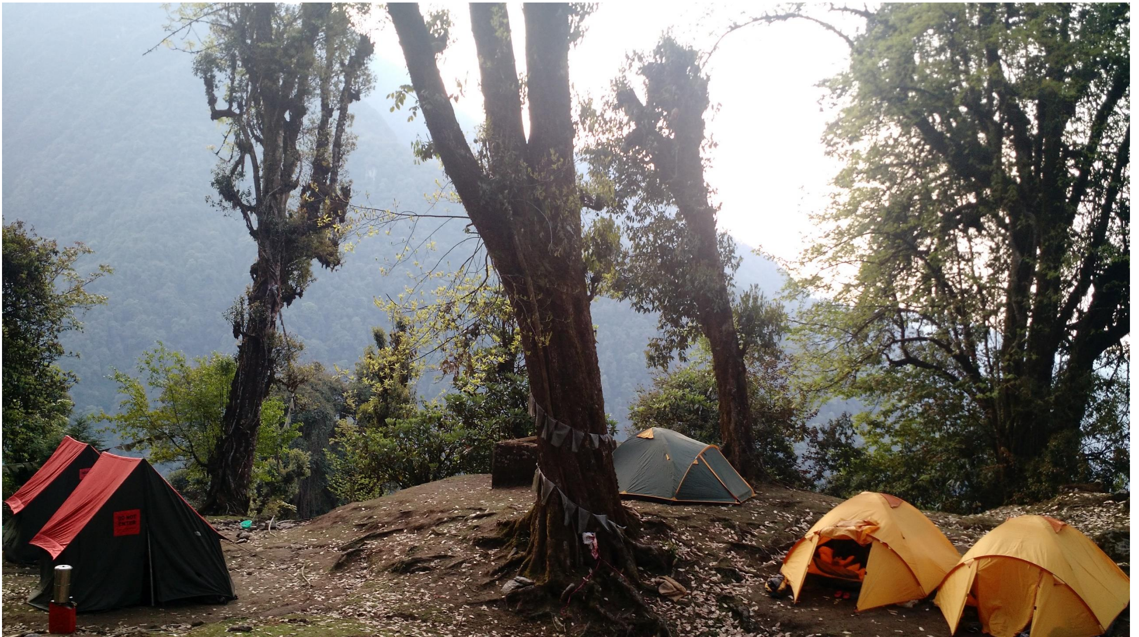
First camp site Bhakim. Kitchen tents on the left and sleeping tents on the right.