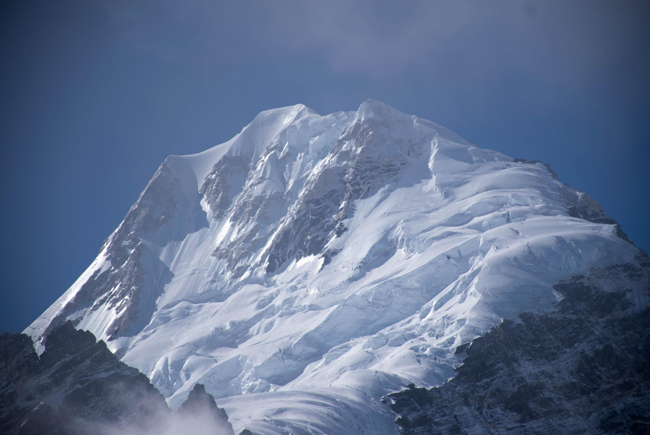
Glaciers shining on mount Pandim. A closer view.