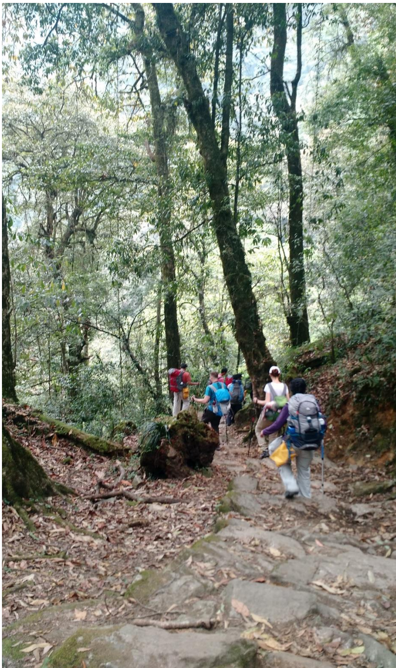
Trek begins through the dense jungle route from Yuksom.