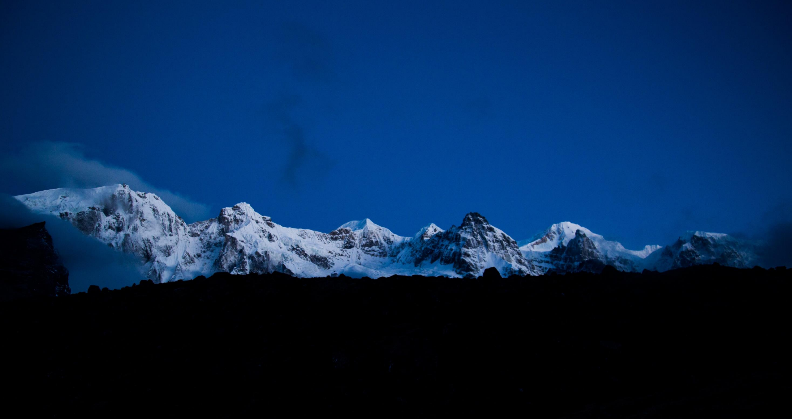
Summit day. The Kanchenjunga range