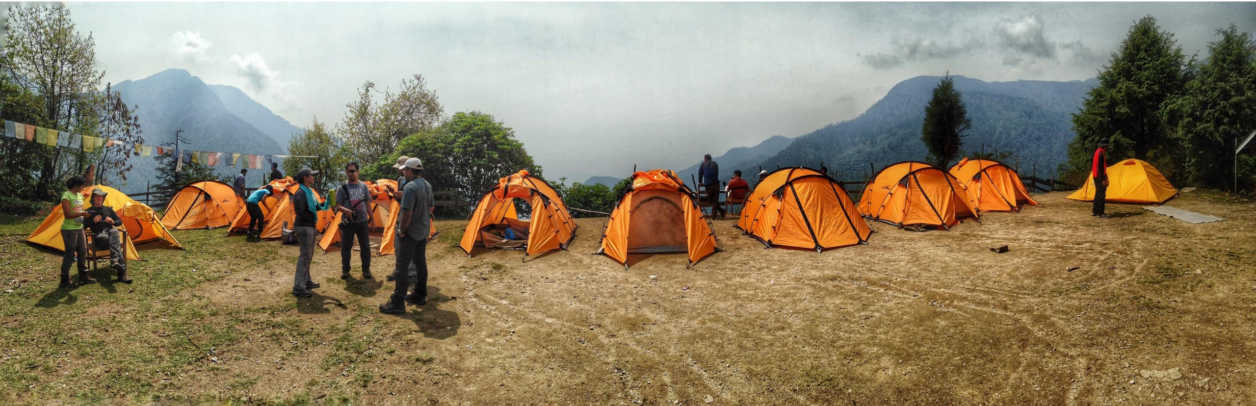
Next camp site at Tsoka. Refreshed & relaxed for a day to acclimatize for higher altitude.