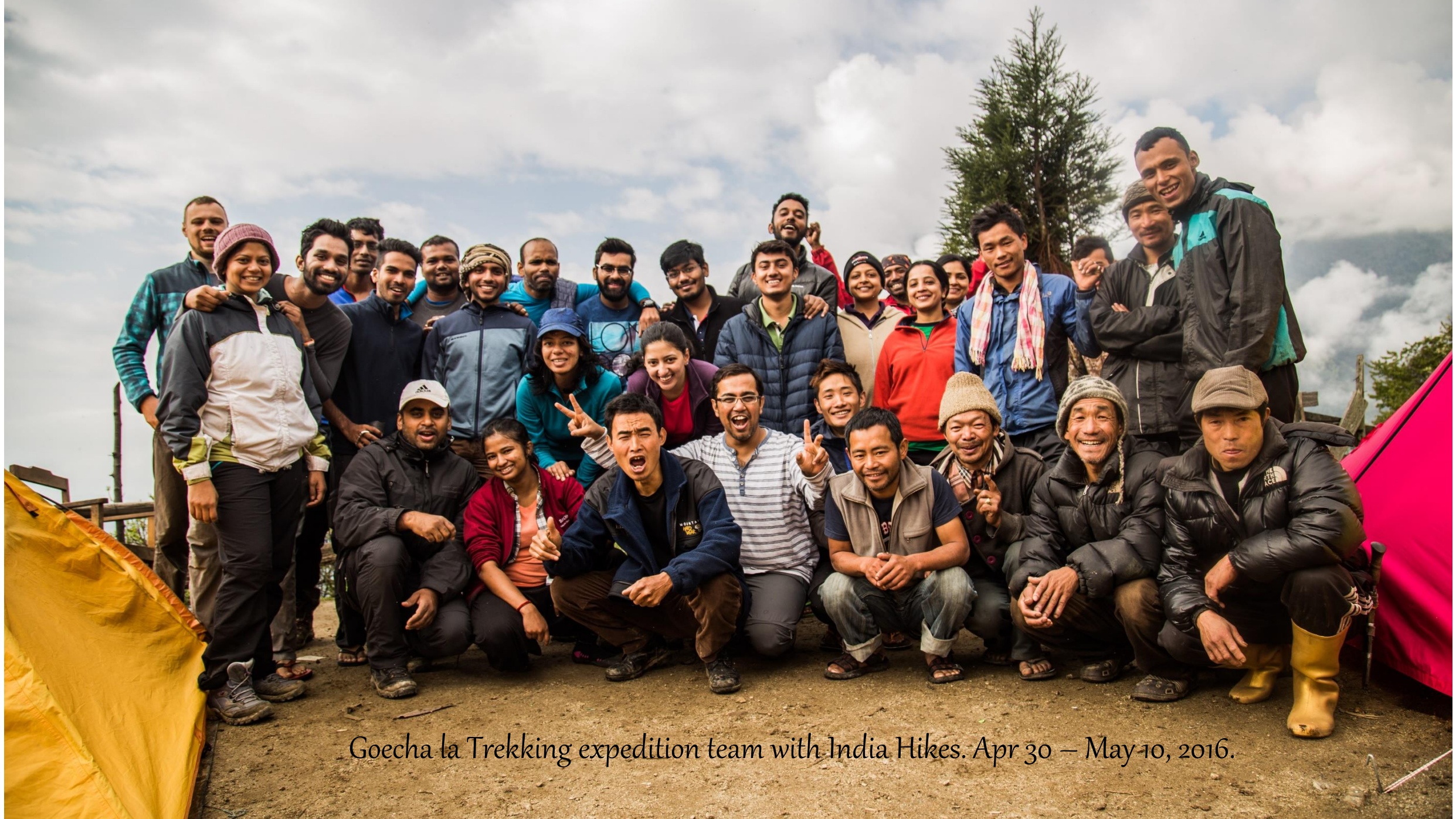
Goecha la Trekking expedition team with India Hikes. Apr 30 – May 10, 2016.