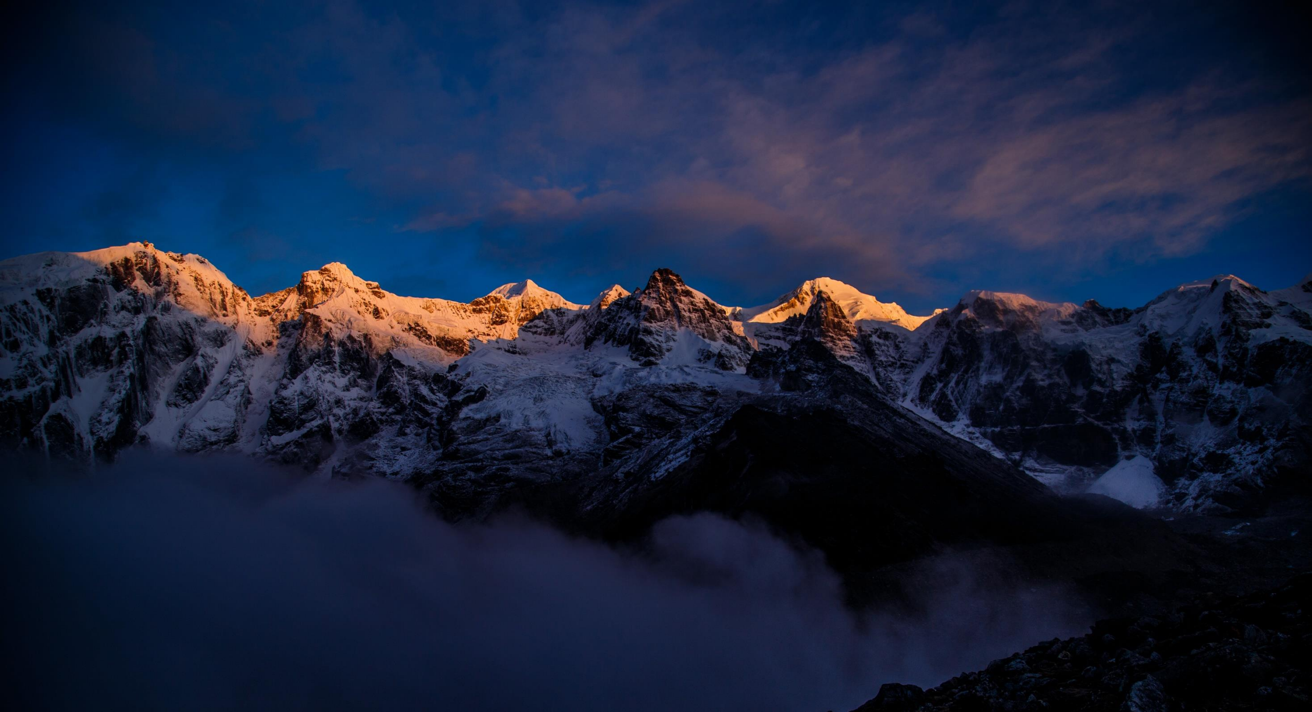
Summit day. Sunrise on Kanchenjunga range.